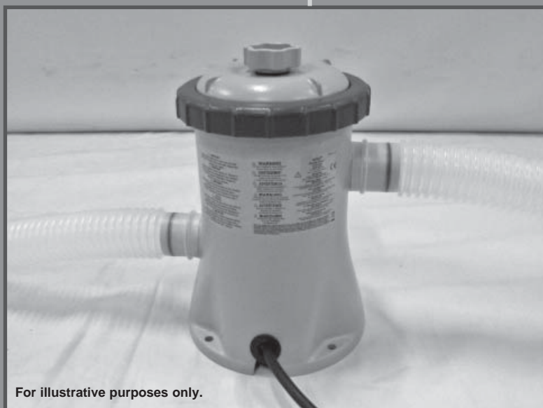
For illustrative purposes only.

Don't forget to try these other fine Intex products: Pools, Pool Accessories, Inflatable Pools and In-Home Toys, Airbeds and Boats available at fine retailers or visit our website listed below. Due to a policy of continuous product improvement, Intex reserves the right to change specifications and appearance, which may result in updates to the instruction manual without notice.